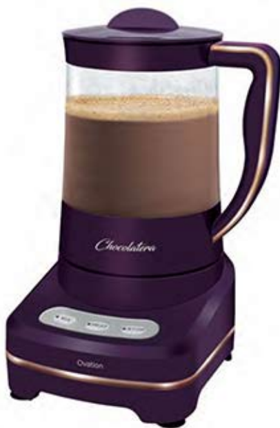
Chocolatera Model no. OV43