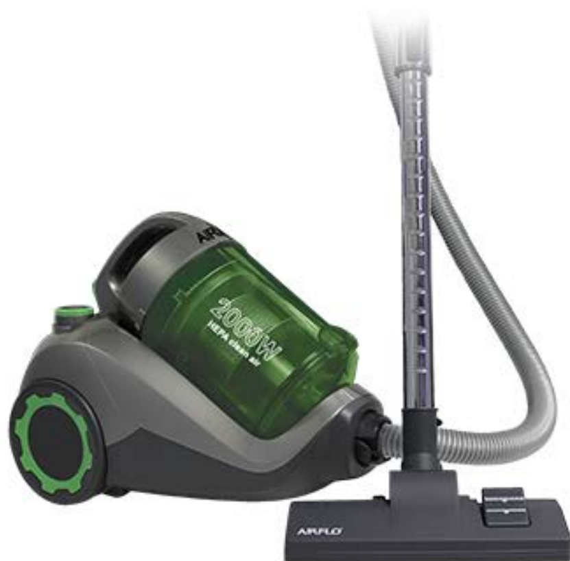
Bagless Vacuum AFV727