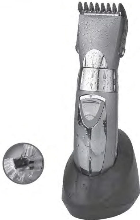
model no. AF1040

▶ Beard Trimmer Great for beards of any length