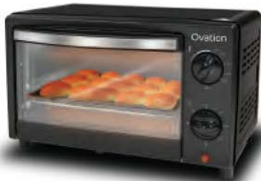
Toaster Oven Model OV09